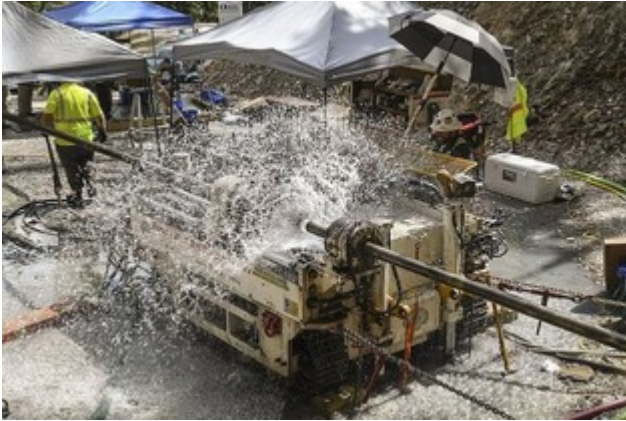
From www.hotsr.com - Today, 09:28

The city is seeking credentials from contractors that will bid on some of the larger components of the Lake Ouachita water supply project.