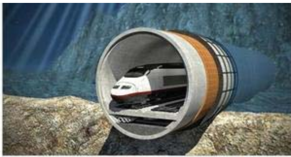
Finest Bay Area Helsinki