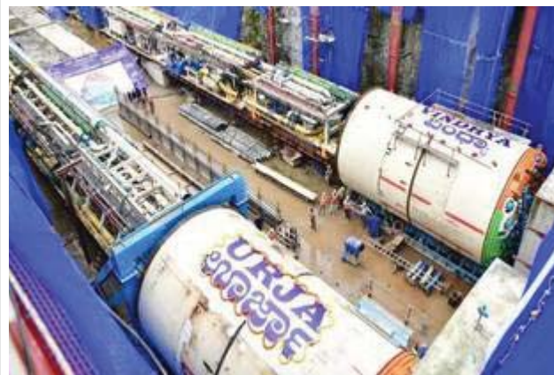
From www.financialexpress.com - 31 juillet, 11:02

Today, BMRCL, after the Chief Minister of Karnataka, B. S. Yediyurappa set a tunnel boring machine, announced the commencement of tunneling work for the city's longest underground metro corridor between Cantonment station and Shivajinagar station.