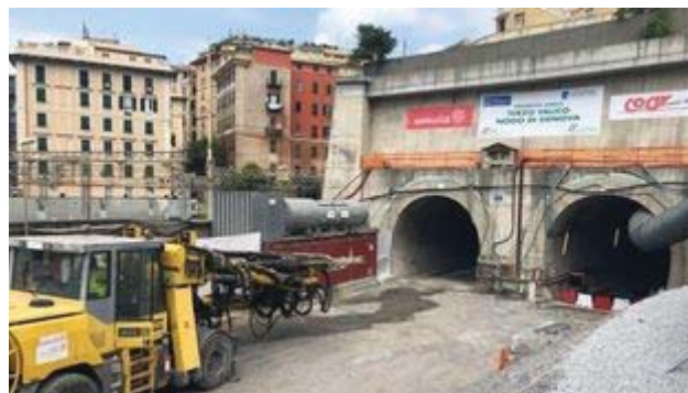
From www.railjournal.com - 24 juillet, 09:39

Construction has resumed on the Genoa Node element of Italian Rail Network's (RFI) €6.9bn Terzo Valico rail project following a two-year suspension of work.