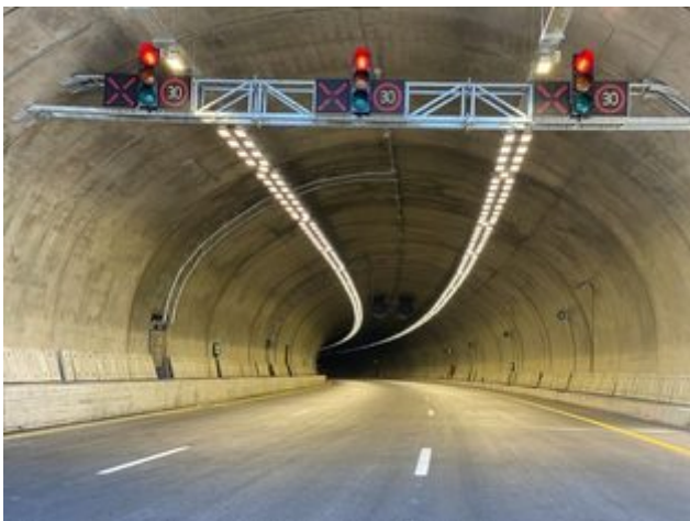
15 June, 10:08