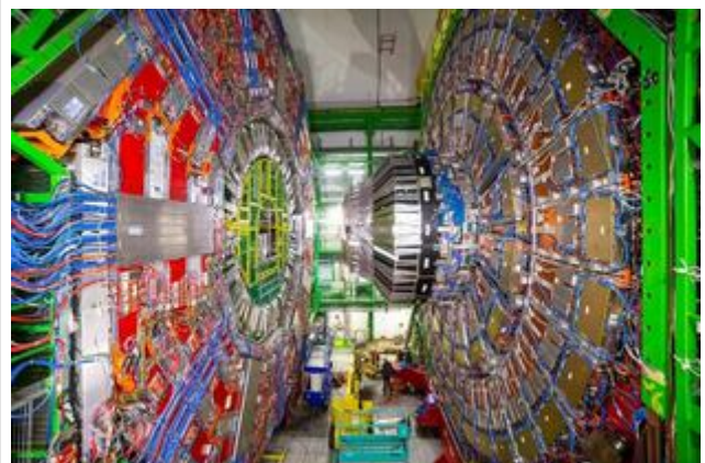
From www.techspot.com - 22 June, 16:54

The European Organization for Nuclear Research, better known as Cern, has approved plans for the FCC, which would allow physicists to study the Higgs boson with more precision, learn more about dark