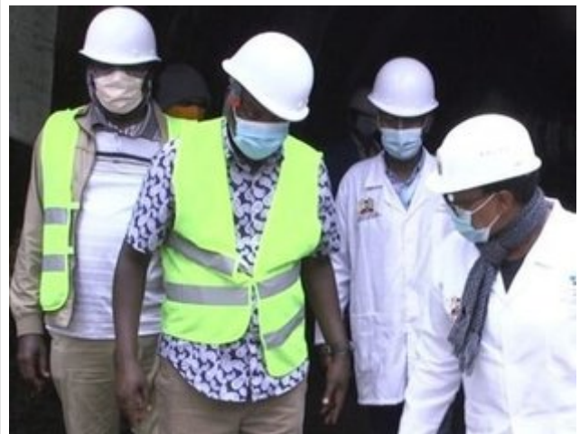
From www.standardmedia.co.ke - Today, 12:14

Residents of Nairobi City County are set to benefit from phase one of the Northern collector tunnel