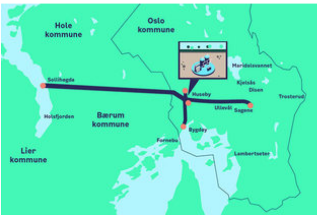
From www.tunneltalk.com - 22 June, 17:09

A single contract has been presented to the market for construction of the new 19km long raw water supply tunnel for Oslo, the capital city of Norway.