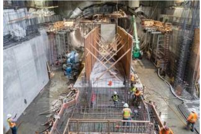
From tunnelingonline.com - 19 June, 14:12

Three times per year, TBM: Tunnel Business Magazine recaps the status of major tunneling projects underway in the United States and Canada.