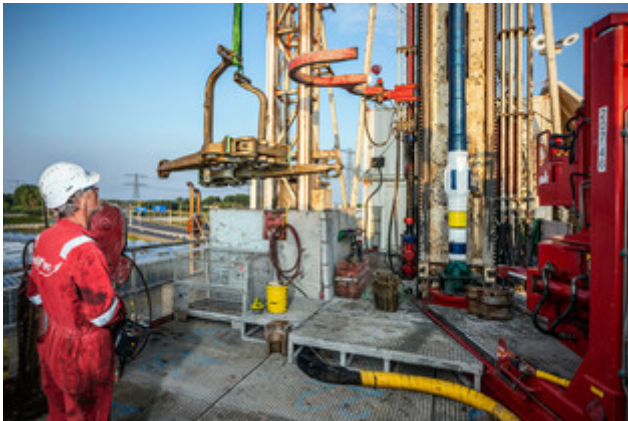
From www.thinkgeoenergy.com - 22 June, 16:45

Geothermal energy at a depth of 2.3 kilometers makes sustainable heat available for another 30 companies (a total of 56 companies) and 345 homes in Liernolen, Netherlands with the start of drilling of a second well for Trias Westland in the Netherlands.